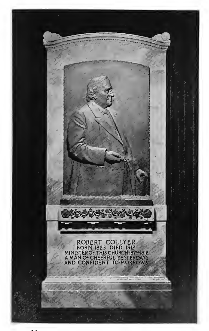
MEMORIAL IN THE CHURCH OF THE MESSIAH Dedicated April 11, 1915